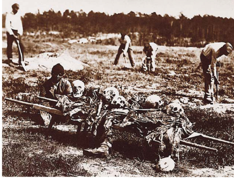
▲ Clearing battlefields of human remains was just one of the many tasks facing Reconstruction governments.

CONGRESSIONAL RECONSTRUCTION Angered by Johnson's actions, radical and moderate Republican factions decided to work together to shift the control of the Reconstruction process from the executive branch to the legislature. In mid-1866, they overrode the president's vetoes of the Civil Rights Act and Freedmen's Bureau Act. In addition, Congress drafted the Fourteenth Amendment , which prevented states from denying rights and privileges to any U.S. citizen, now defined as "all persons born or naturalized in the United States." This definition was expressly intended to overrule and nullify the Dred Scott decision.