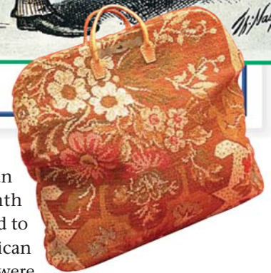
▲ a carpet bag

The third and largest group of Southern Republicans—African Americans—gained voting rights as a result of the Fifteenth Amendment. During Reconstruction, African-American men registered to vote for the first time; nine out of ten of them supported the Republican Party. Although many former slaves could neither read nor write and were politically inexperienced, they were eager to exercise their voting rights.